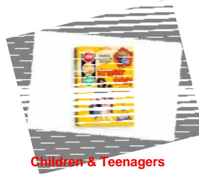
Children & Teenagers