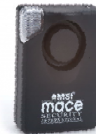
Woman, Men, The Elderly